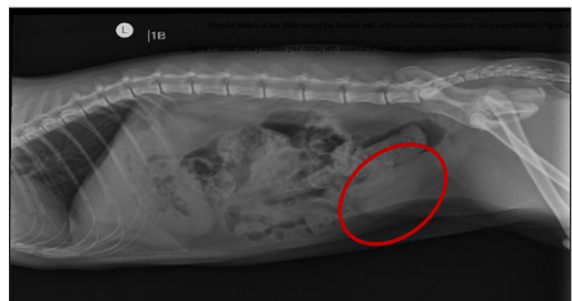
Figure 1. Small urinary bladder (red circle) with absence of cystolith on the left lateral view of radiograph

An abdominal radiograph and ultrasound revealed a small urinary bladder with no urethral abnormalities and urolith (Figure 1). There was mild thickening of the bladder wall, an irregular pattern at the distal part of the bladder wall, and snowflake echogenicity in the urinary bladder (Figure 2).